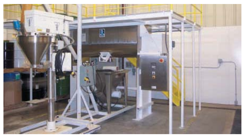
A Ross Ribbon Blender at a food facility used to prepare several different recipes including sweeteners, spice blends and trail mixes.